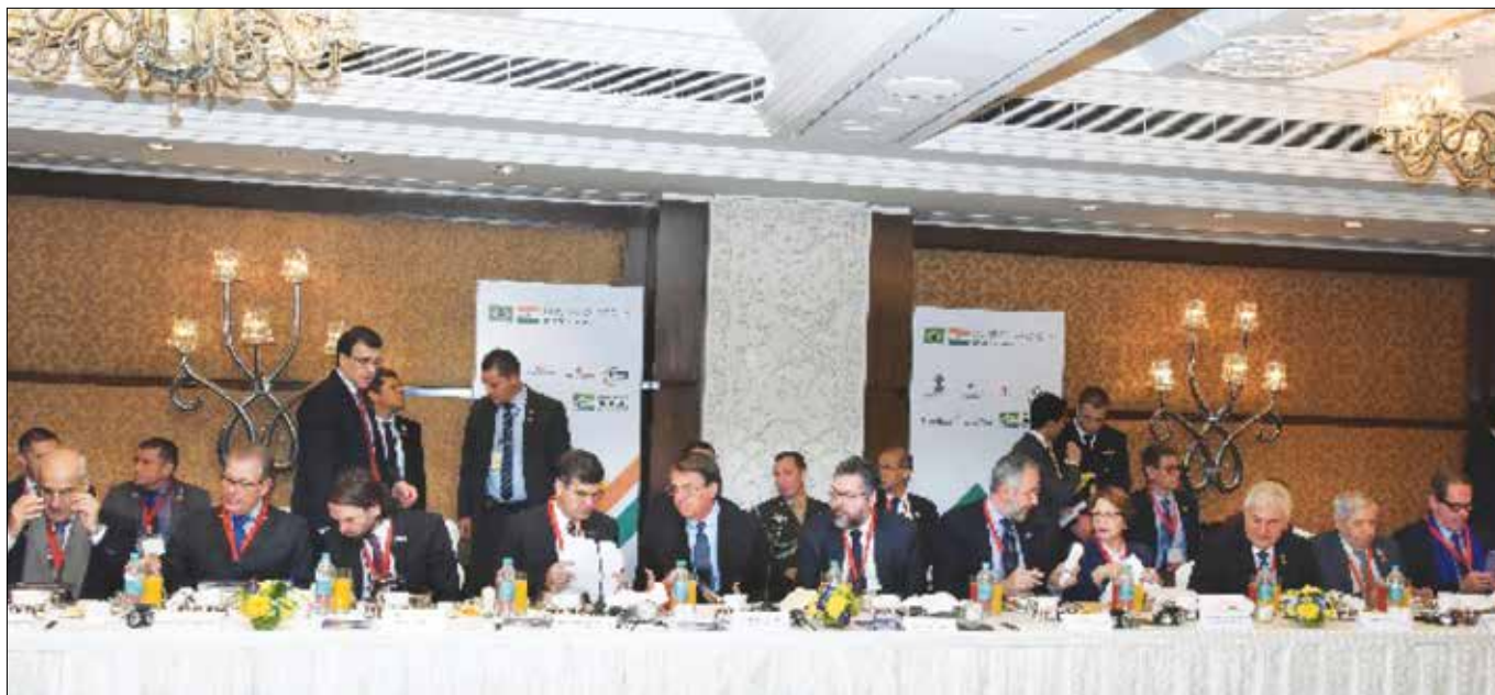
The Breakfast Roundtable was followed by the inaugural session of India-Brazil Business Forum.

of Brazil, in his keynote address mentioned that India and Brazil share a common future and that both countries must continue to strive towards a stronger bilateral relationship. He shared how trust, honesty and loyalty are shared values of both his and the Indian government's, and that these will go a long way in strengthening the existing bilateral bonds. He added that he is delighted with this visit to India, with his meeting with Prime Minister, Shri Narendra Modi and with the wonderful people.