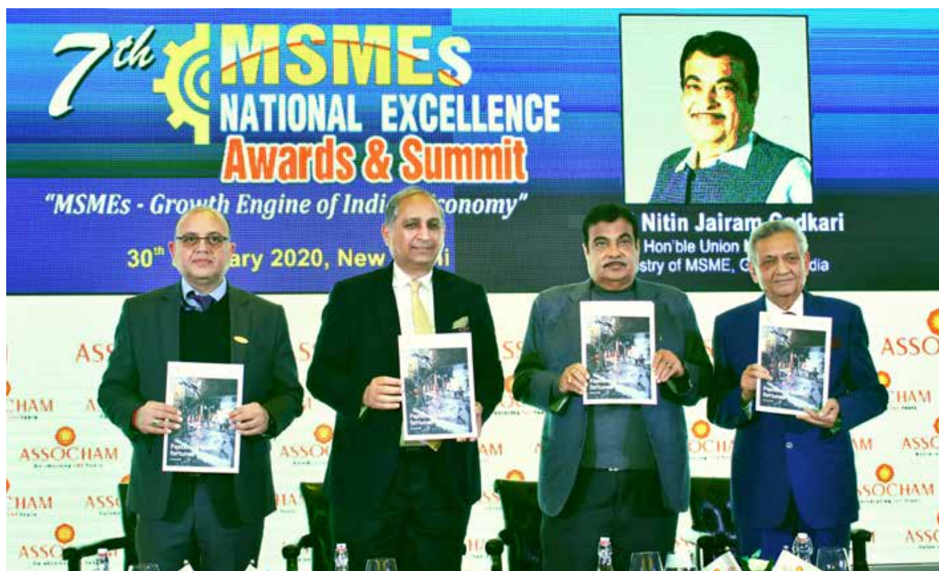
Release of Knowledge Report by Chief Guest, Shri Nitin Jairam Gadkari, Hon'ble Union Minister, Ministry of MSME, Government of India and other dignitaries in the Special Interactive Session at the ASSOCHAM 7th National MSMEs Excellence Awards & Summit.

need to go much higher for the upliftment of masses. For the nation to grow as a whole, we need to research, manufacture and develop in India. Government is supporting and promoting MSMEs through initiatives to enhance ease of doing business, give them access to market etc. but these efforts need to be expanded given the vastness of this great country."