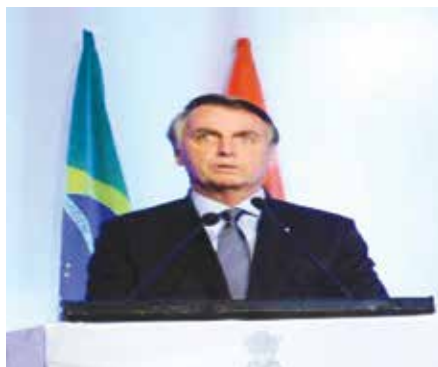
H.E. Mr. Jair Bolsonaro, President of the Federative Republic of Brazil, addressing the India-Brazil Business Forum.