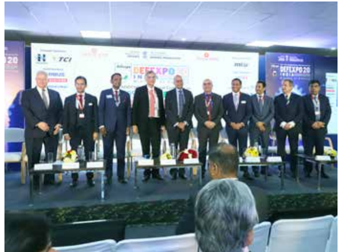
Dignitaries on the dais on the occasion of 11 th ASSOCHAM International Conference on Aerospace and Defence on 5th February, 2020 during the DEFEXPO 2020 at Lucknow.