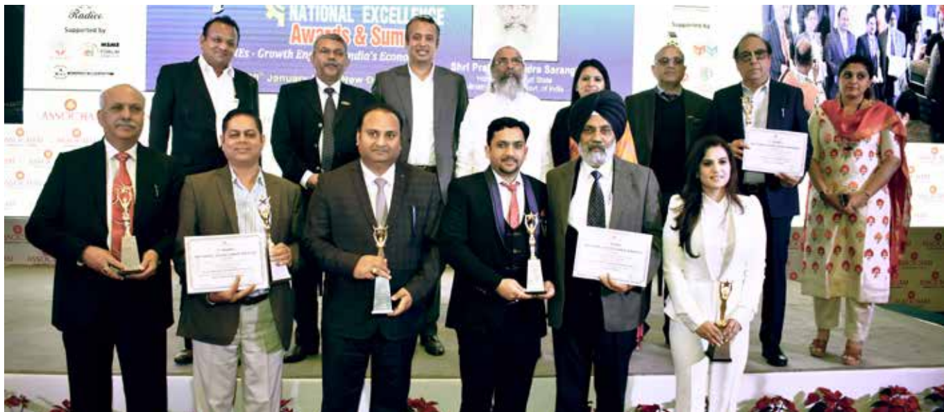
MSME Awardees in the Silver Category at the ASSOCHAM 7 th National MSMEs Excellence Awards & Summit.