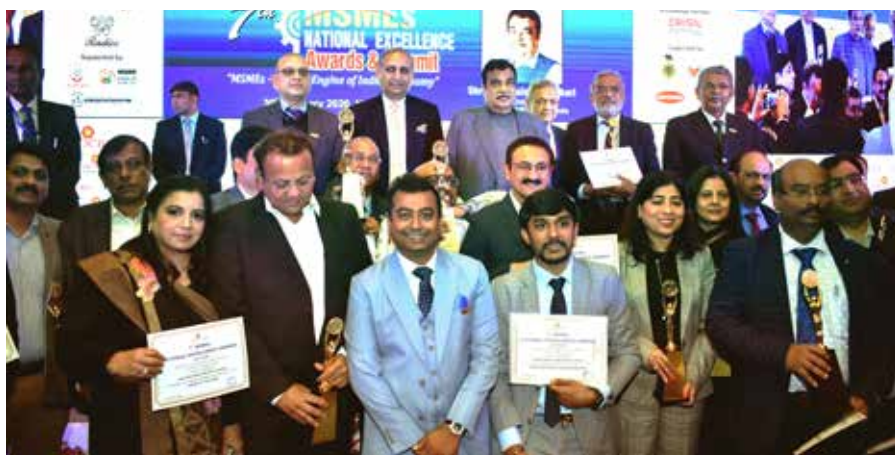
MSMEs and Banks & NBFCs Awardees in the Gold Category at the ASSOCHAM 7 th National MSMEs Excellence Awards & Summit.

The event included sessions on 'Challenges & Opportunities for Indian MSMEs' and 'Leveraging Technology for MSMEs growth'. These sessions were attended by senior government officials, industry stalwarts, NGOs and representatives of various industry associations. ■