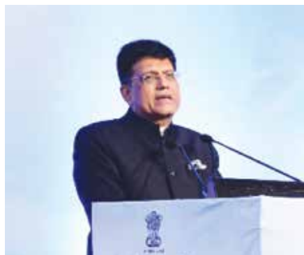
Mr. Piyush Goyal, Honorable Minister for Commerce & Industry and Railways, Govt. of India addressing the India-Brazil Business Forum.