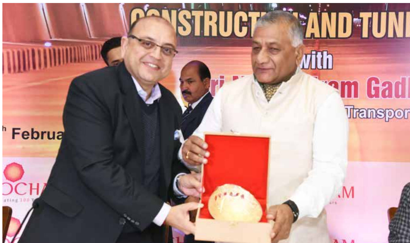
Shri Deepak Sood, Secretary General, ASSOCHAM felicitating Gen. (Dr.) V. K. Singh, Minister of State for Road Transport and Highways.

International said that Himalayan rocks are new and thus results in geological surprises. Rock classification changes every 50 meters. Use of item rate contract compensated the concerns of contractors and general disputes encountered were very less. However Ministry has reservations on item rate contracts. In EPC contracts, there is need for balanced risk matrix. Owing to completion time-line overrun, losses incurred in large tunnelling projects is huge. As such very less contractors are left who can execute tunnelling work (hardly 2-3). The need is therefore to address risk sharing between developer and contractors.