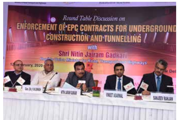
Hon'ble Union Minister of Road Transport and Highways Shri Nitin Jairam Gadkari addressing the gathering.