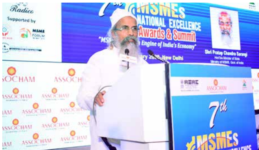
Shri Pratap Chandra Sarangi, Hon'ble Minister of State, Ministry of MSME, Government of India Addressing the participants.