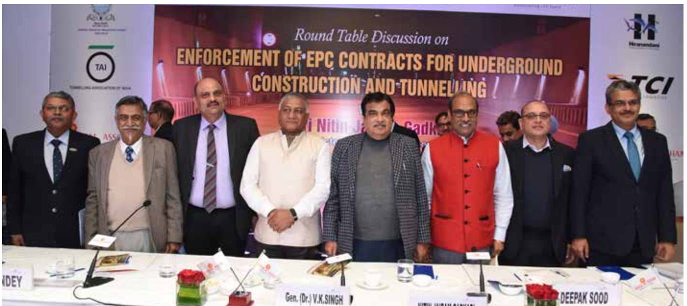
Hon'ble guests of the evening with Core Council members of ASSOCHAM's council on Construction Equipment and Tunneling