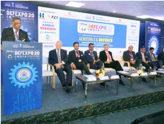
Shri Baba Kalyani, Chairman & Managing Director, Bharat Forge Ltd. Addressing the gathering at the 11 th ASSOCHAM International Conference on Aerospace and Defence on 5th February, 2020 during the DEFEXPO 2020 at Lucknow.