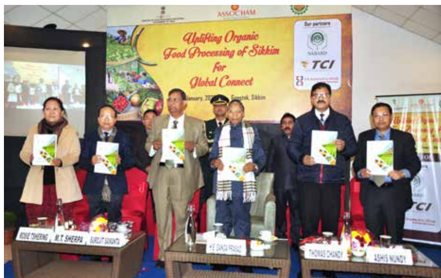
Release of ASSOCHAM knowledge report by Dignitaries.