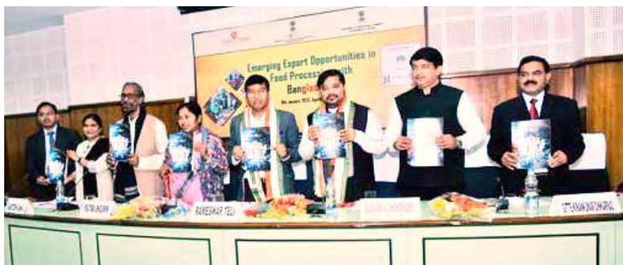
Releasing the knowledge report on Food Processing Logistics.

The conference proved an excellent opportunity for gaining knowledge on international trade related issues/ Regulatory issues / laws relating to Food Processing/ Food Safety, available schemes of central and state govts and potential in food processing sector in Tripura and sharing experiences with the experts and entrepreneurs to the sector. The special attraction was (Export Processing Zone) which is the single window system and multi ministry zone where entrepreneurs can come and have all the clearance and can set up their business for export/import.