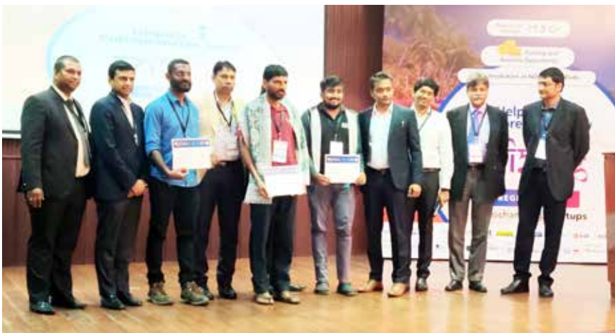
Winners of ASSOCHAM STARTUP LAUNCHPAD held at Vizag.