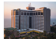
Mumbai – 2024 Taj Lands End