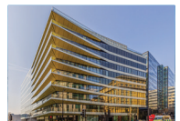
London 2024 Fieldfisher