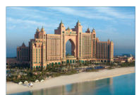
Dubai 2014 Atlantis the Palm