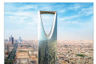
Riyadh – 2024 Kingdom Tower