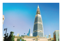
Riyadh – 2016 Al Faisaliah Hotel