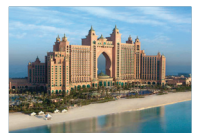
Dubai – 2016 Atlantis the Palm