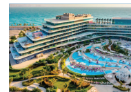
Dubai – 2025 W The Palm