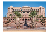
Abu Dhabi – 2016 Emirates Palace Hotel