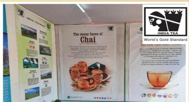
Tea Board India's participation at 4th Emerging North East Guwahati & Dibrugarh, Assam, 19-21 February 2021