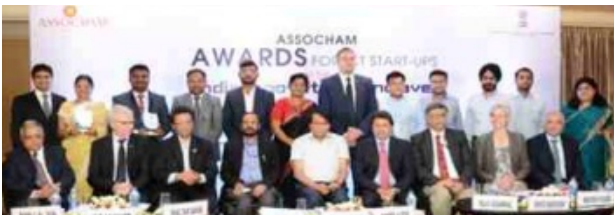
Group Photo: Distinguished speakers and award winners With Shri Suresh Prabhakar Prabhu, Hon'ble Minister, Ministry of Railways, Govt. of India