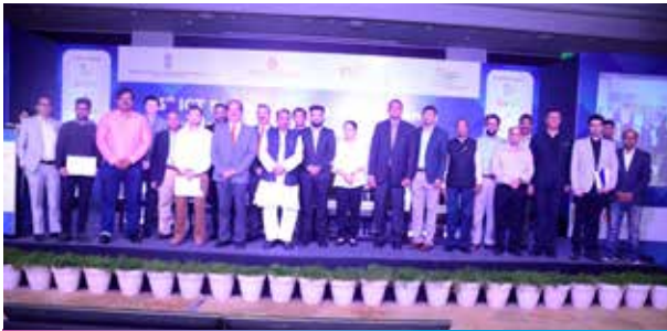
Group Photo: Distinguished speakers and award winners with Shri Bhanu Pratap Singh Verma, Hon'ble Minister of State (MOS), Ministry of MSME, Government of India