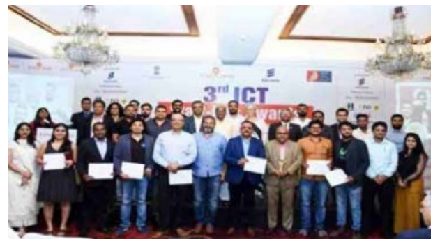
Group Photo: Distinguished speakers and award winners With Shri Dhotre Sanjay Shamrao, Hon'ble Minister of State (MOS), Ministry of Electronics & Information Technology, Govt. of India