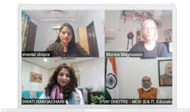
Shri Sanjay Dhotre, Hon'ble Minister of State for Education, Communications and Electronics & Information Technology, Govt. of India