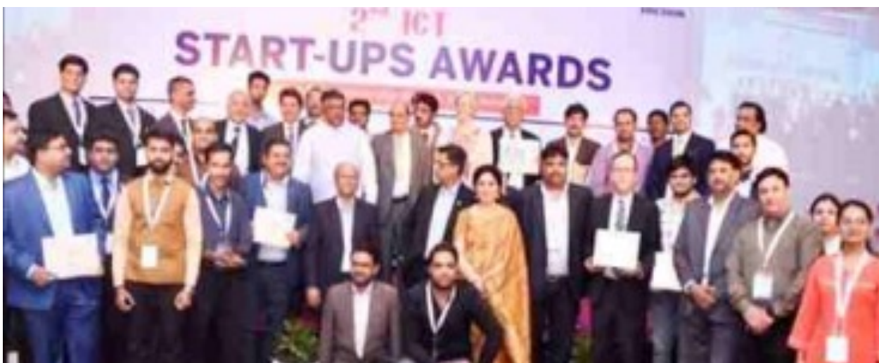
Group Photo: Distinguished speakers and award winners With Shri Ravi Shankar Prasad, Hon'ble Minister, Ministry of Electronics & Information Technology, Govt. of India